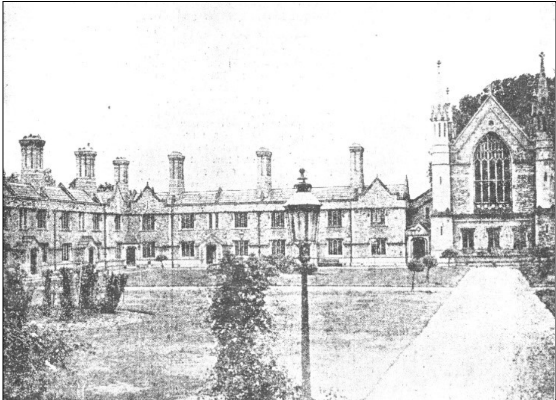
St Peter's Hospital in 1923 shortly before it was demolished.

A number of the flats on the LCC's East Hill Estate were damaged during an air raid in April 1941, and the whole development eventually suffered the same fate as St Peter's Hospital. Today newer housing stands on the site, but still residents pass through the old almshouse gates, with only the Wandsworth Society plaque dating from 1996 to give them any background to the symbolism of the fishes carved on the gate posts.